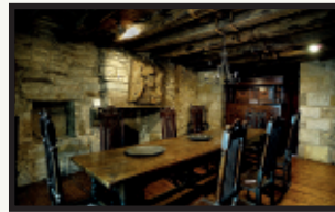
5 Cuthbert Simpson's room