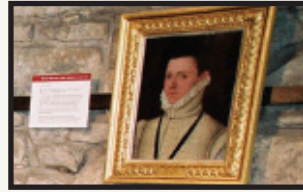
4 Royal portraits