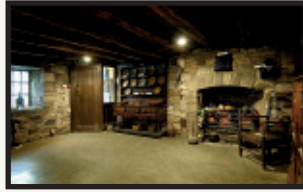
1 The kitchen

Things you must see at Provand's Lordship