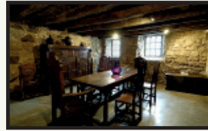
3 Scottish Furniture