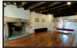
6 Art Gallery