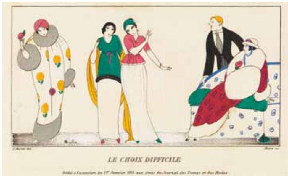
Le Choix Difficile (The Hard Choice), Charles Martin, 1913.