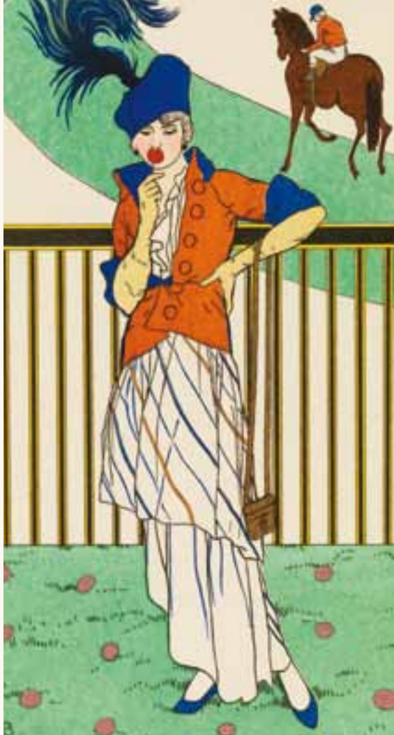
Detail of pouchoir print, 10 July 1913.

Glasgow Museums holds 17 volumes of this important, rare magazine. A La Mode exhibits 40 of their stunning prints and captures the essence of Parisian chic.