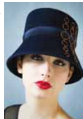
Cloche Hat, William Chambers Millinery