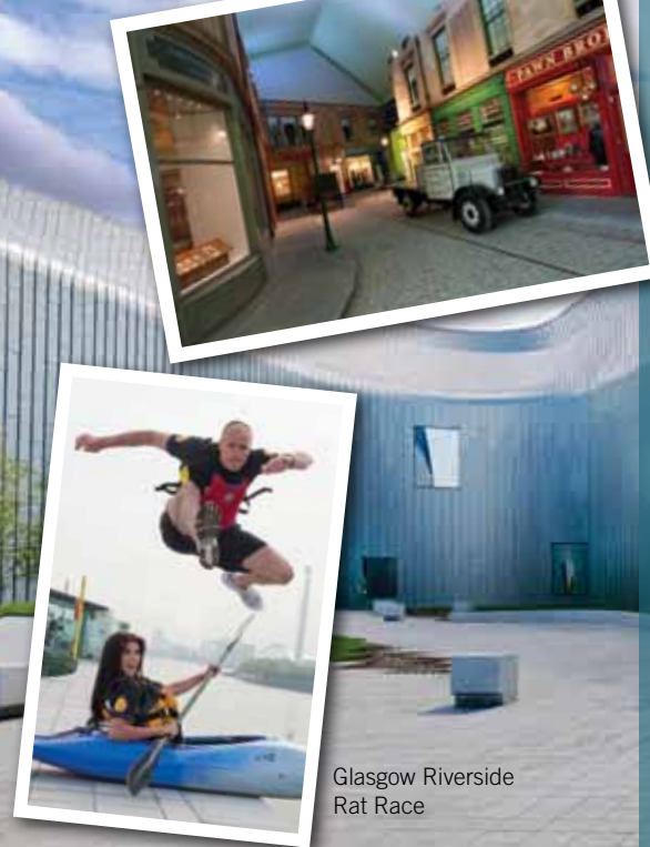
Glasgow Riverside Rat Race