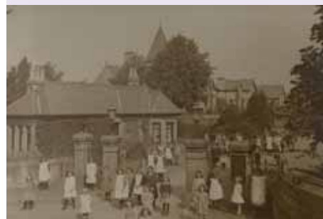
Girls at the gateway to the village, courtesy Quarriers

The exhibition features a film created with the 1st Quarriers' Village Scout Group (45th Greenock and District).