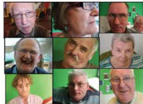
Govan Seniors Film Group

Tying in with themes in British Art Show 7 , artist Anne-Marie Copestake and film-maker Kirsten MacLeod are working with three groups of different ages from Glasgow. The Govan Seniors Film Group, Tramway's Time for Art group for over 55s, and young people from the south east of the city will all present new work during the run of the exhibition.