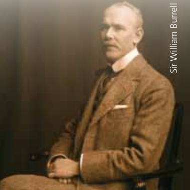
Sir William Burrell

Themed Tour: What your clothes say about you 12.30pm, FREE, drop in