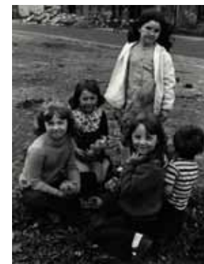
Children: Gullane Street, Malcolm R. Hill, Partick Survey, 1975

This is an exhibition of images taken in Glasgow in the 1970s as part of a photographic survey of the city. It reflects ordinary home life, work and play at a time of great social change. A book of the exhibition's photographs is available to buy in the shops now.