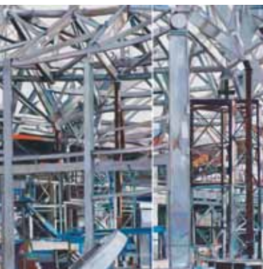
Triptych 2 (detail)