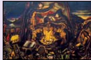
5 People's Palace History Paintings Ken Currie