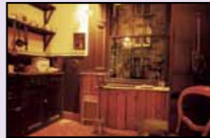
6 The Single End