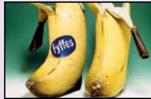
4 Billy Connolly's Banana Boots