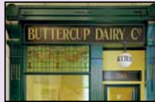
3 The Buttercup Dairy