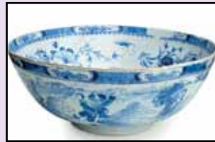
1 Delftfield Punch Bowl