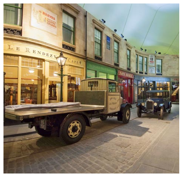
Above: The Street inside Riverside Museum.

In Riverside Museum you can see a display of an oldfashioned cobblestone street with lots of different shops.