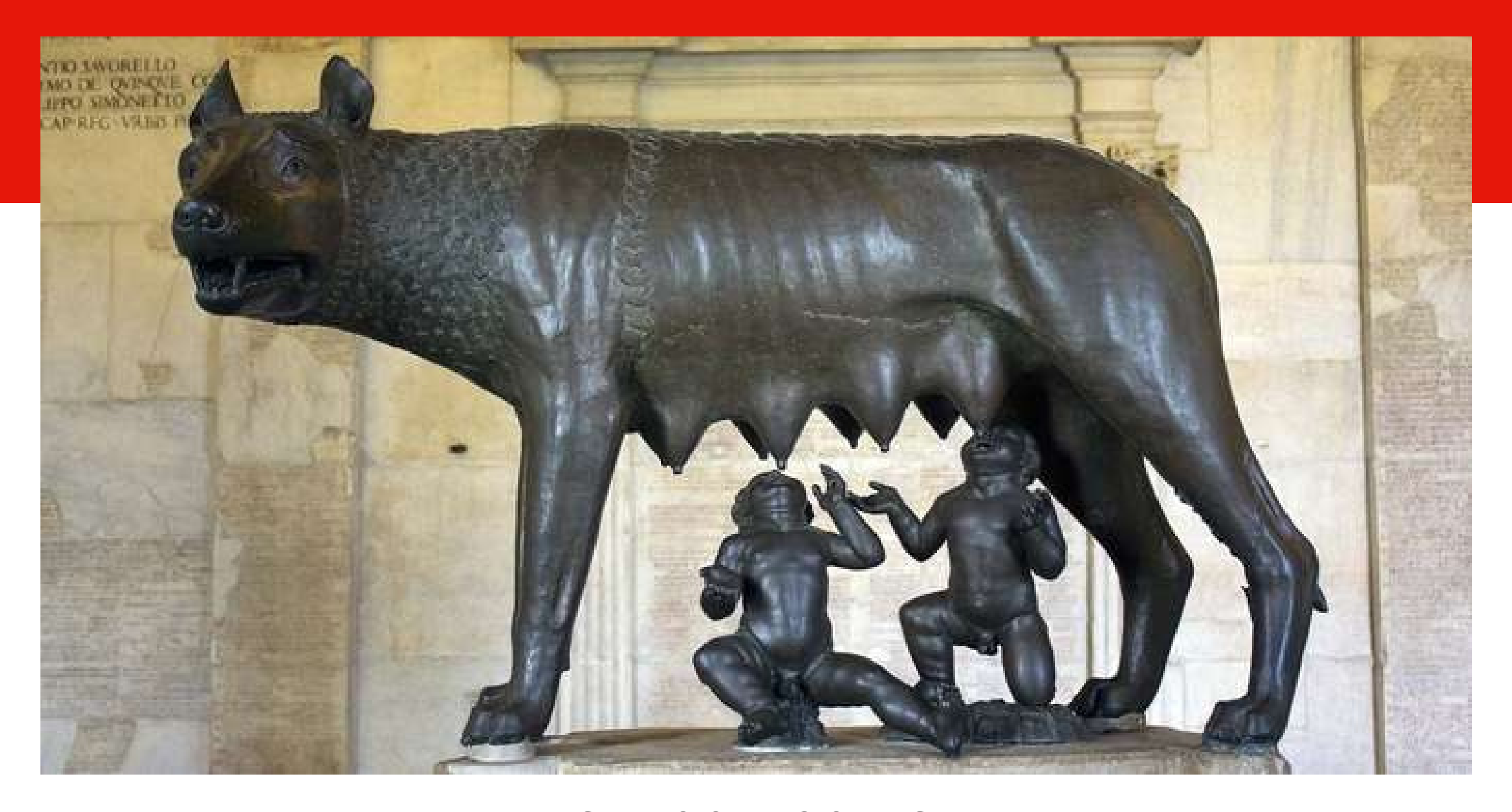
C. 500-480 BCE CAPITOLINE MUSEUMS, ROME