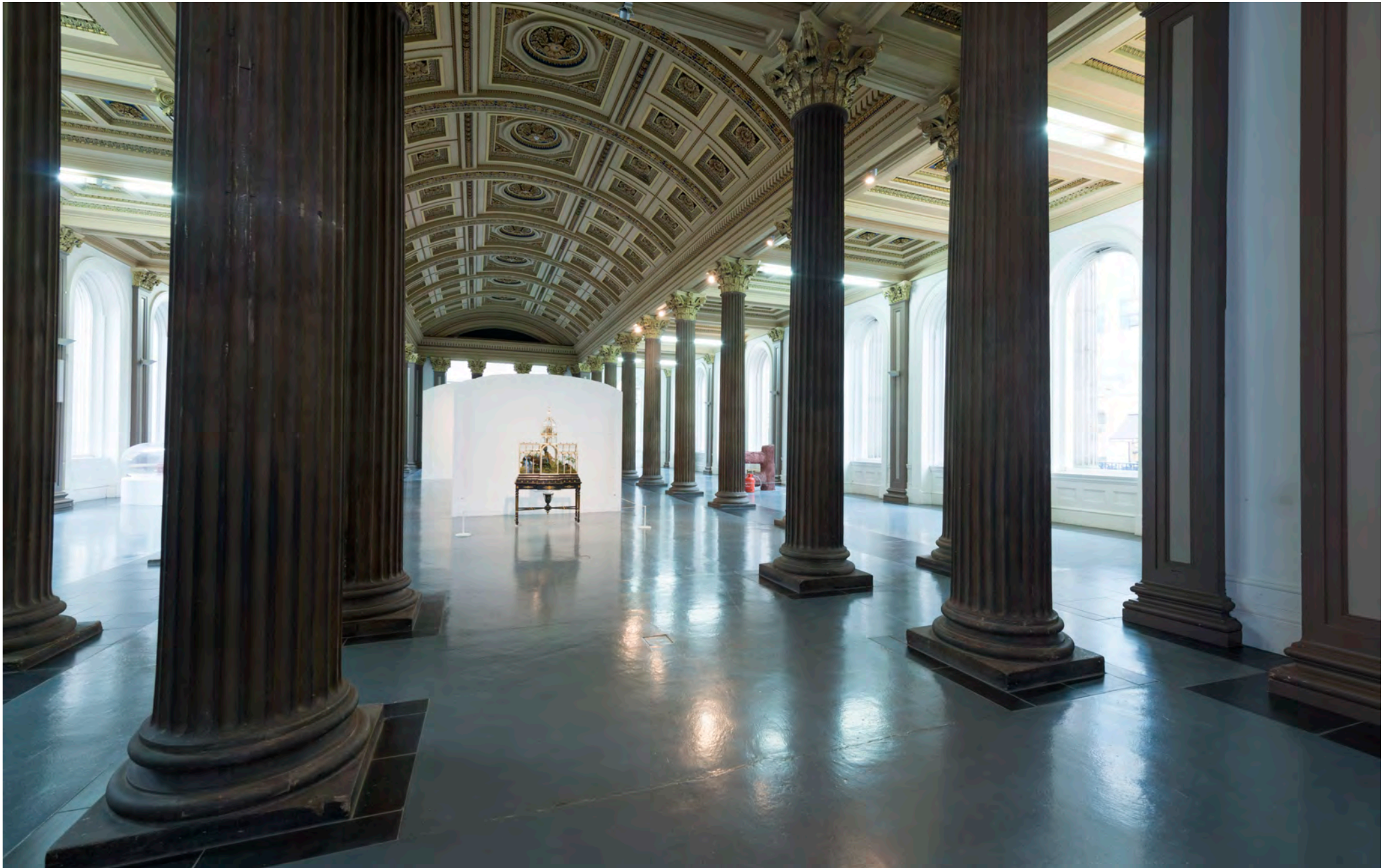
The art in Gallery 1 changes a lot.