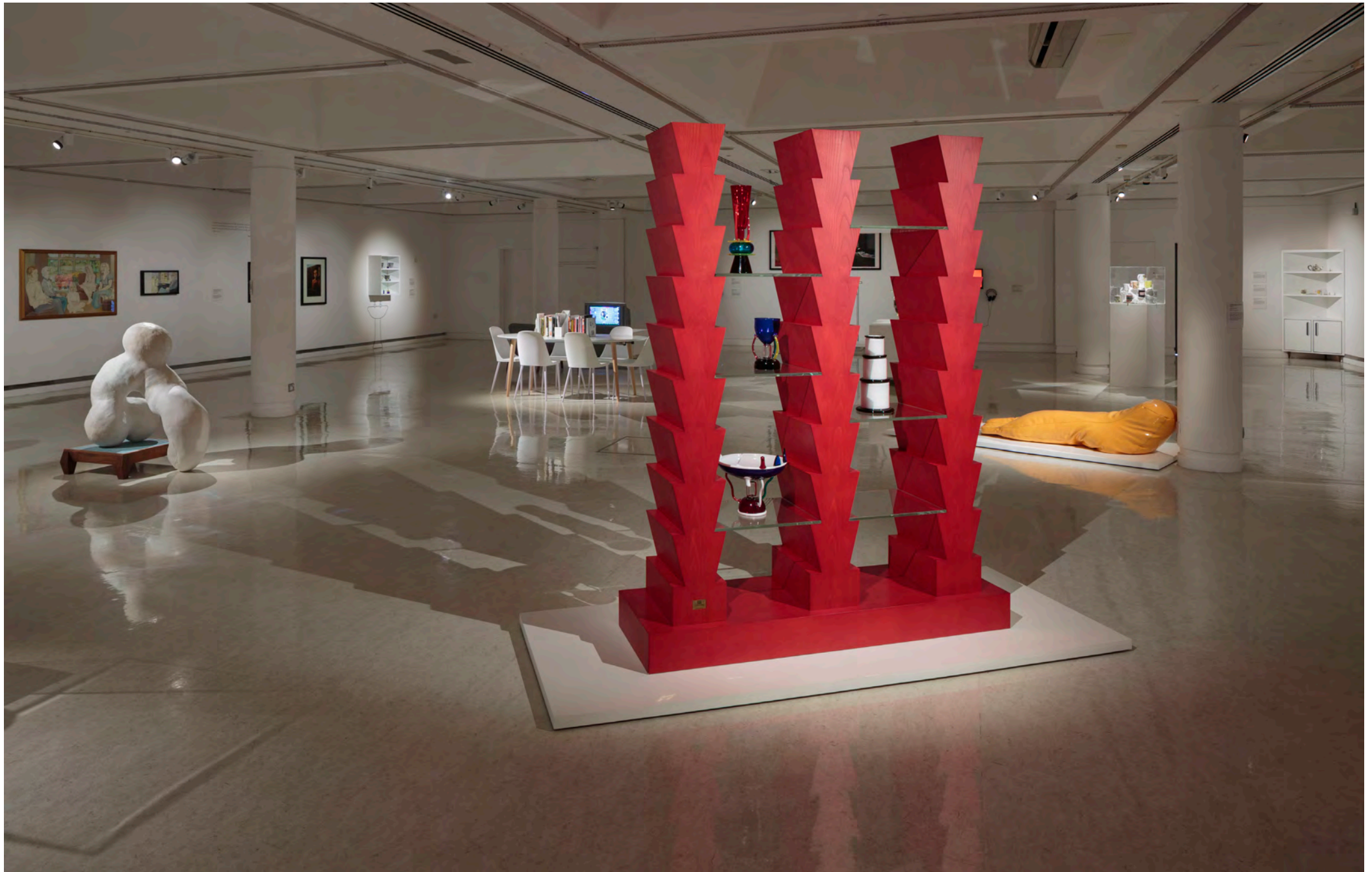
Gallery 4 is upstairs on the second floor. There is art on the walls and art in boxes.