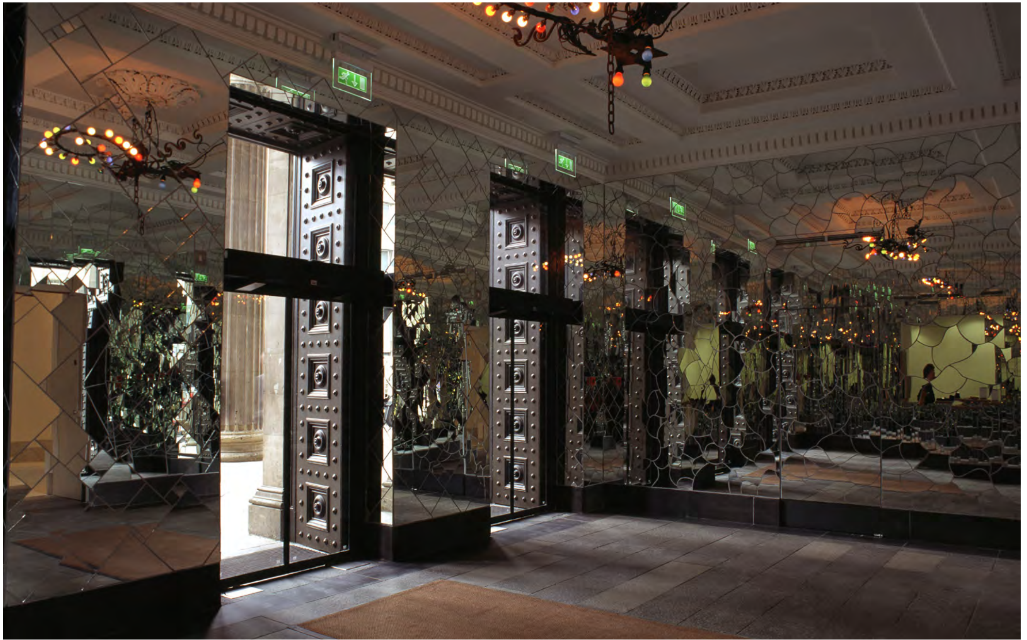
There are lots of mirrors on the walls.