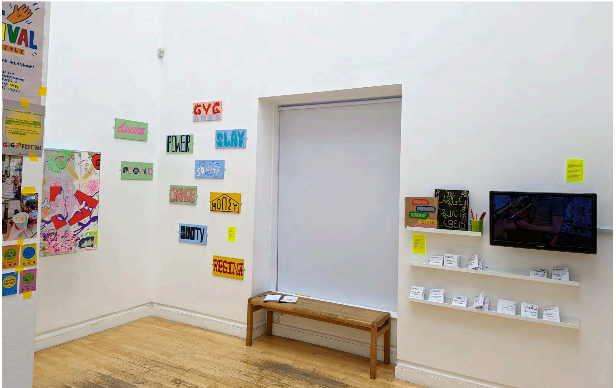
The common space is at the back of Gallery 2. This space changes a lot and is sometimes closed.