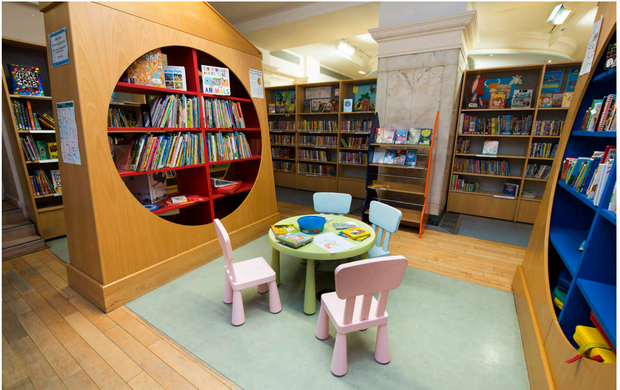
There is a Junior section where children can read and draw.