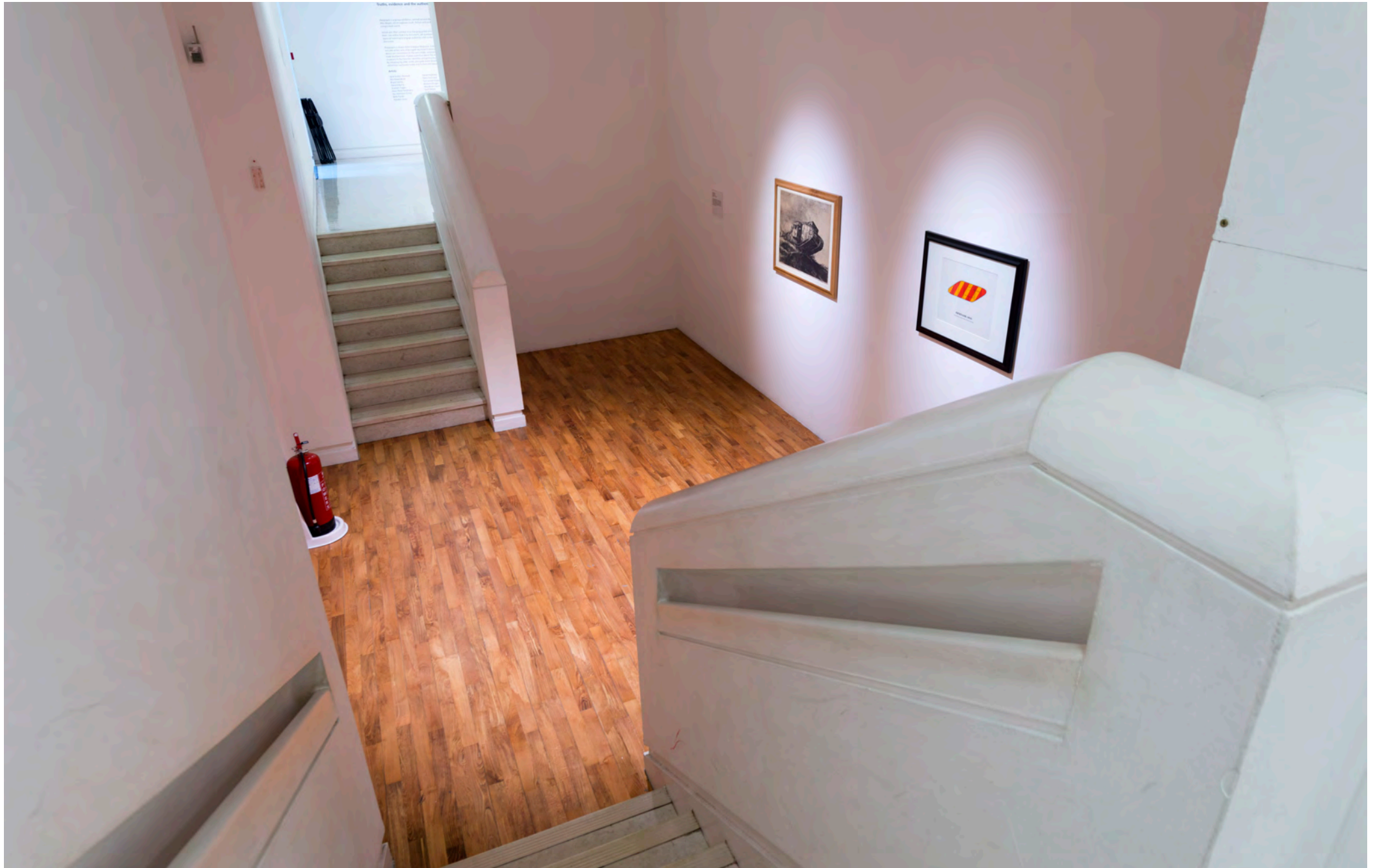
There is a sunken space.