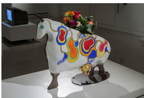
Nikki de Saint-Phalle, Vache Vase, 1992