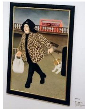
Beryl Cook, By the Clyde, 1992