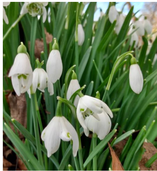
Snowdrops & Crocuses

The trees and shrubs seem like they will burst into leaf soon and many had flowers or catkins. Google explains that a catkin is a slim, cylindrical flower cluster, with inconspicuous or no petals, usually wind-pollinated but, in the case of willow, insect-pollinated. Male and female catkins are different but usually a tree or shrub has both.