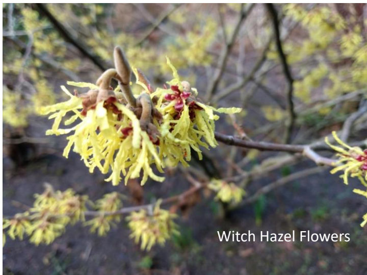
Witch Hazel Flowers

I enjoyed slowing down and taking time to examine everything closely (although Bunty was not so impressed!). I found it very relaxing and mindful so highly recommend you give it a go!