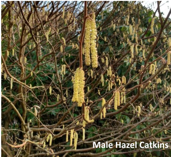
Male Hazel Catkins

Every day's a school day and Spring is definitely in the air!