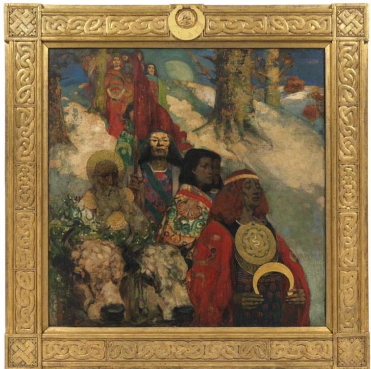
The Druids – Bringing in the Mistletoe, 1890, by George Henry.