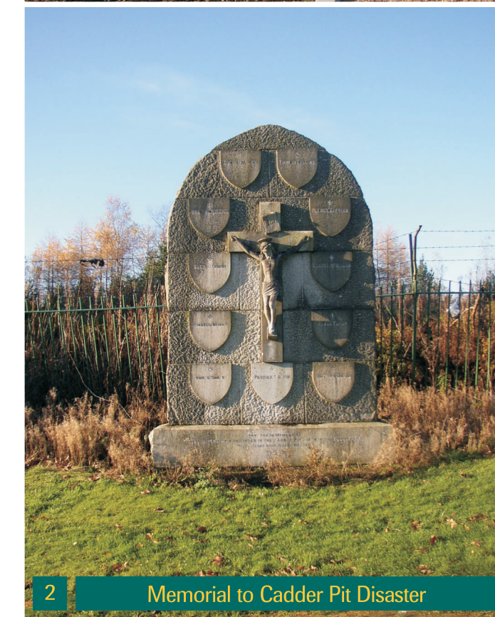
2 Memorial to Cadder Pit Disaster