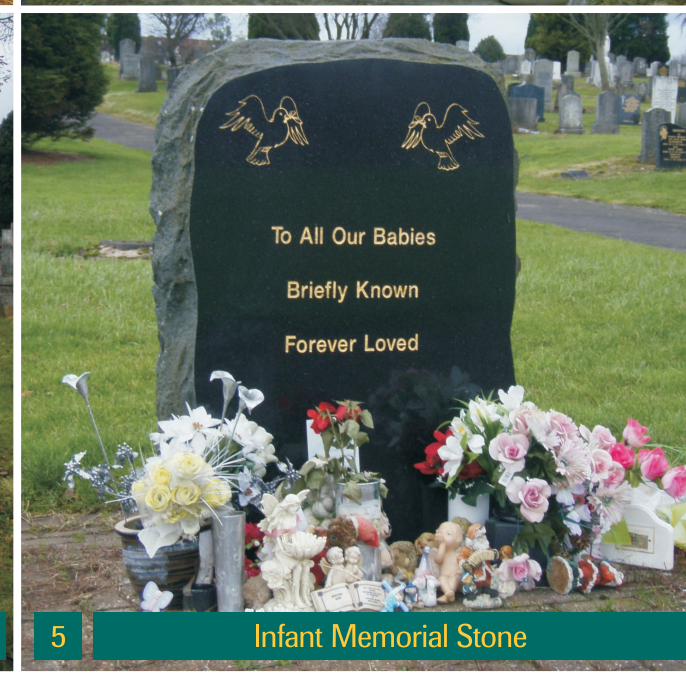
5 Infant Memorial Stone