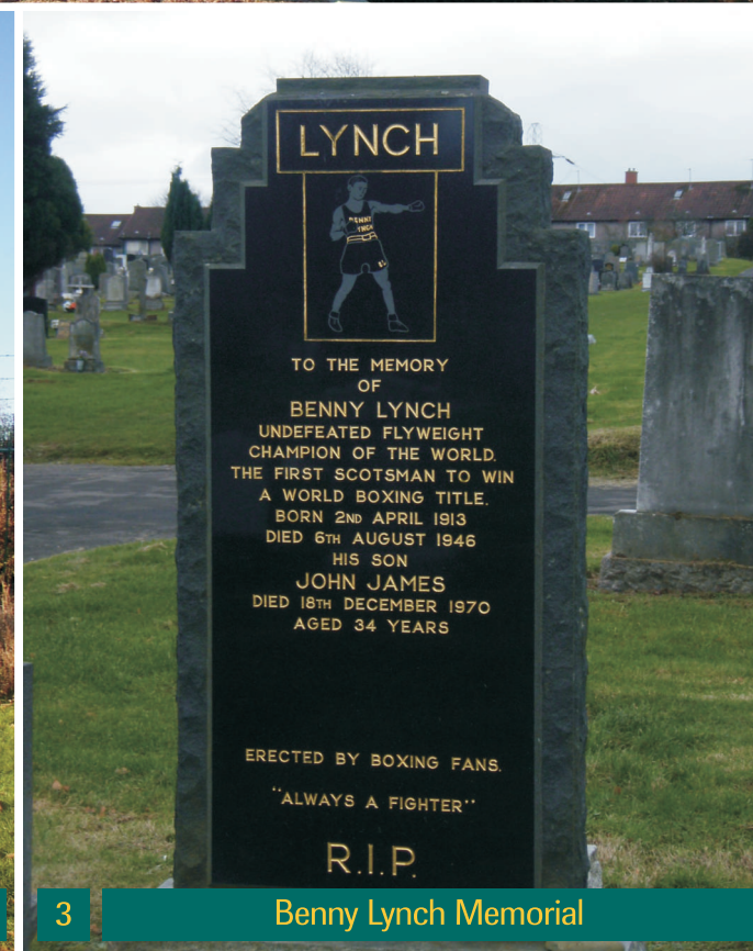
3 Benny Lynch Memorial