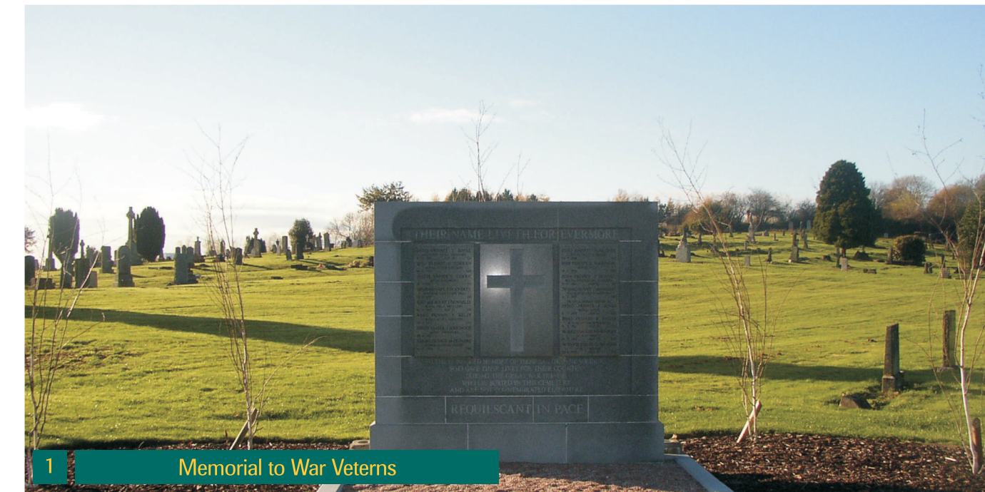
1 Memorial to War Veterans