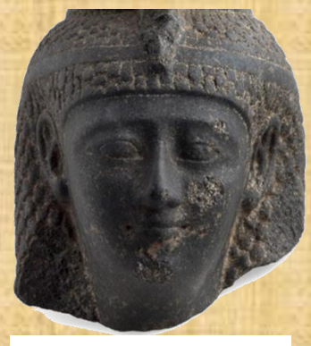
C&C Glasgow Museums 13.273

Can you see the crown that this queen is wearing? This is called the uraeus. It is the head of a dangerous snake called a cobra and would have been made out of gold. Only the pharaoh and the queen wore it in ancient Egypt. On this statue, the snake head is on a headband. We are going to make one for our teddies.