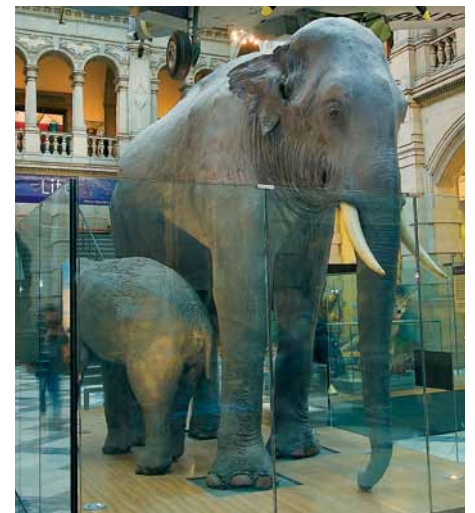
6. Sir Roger Gallery: West Court