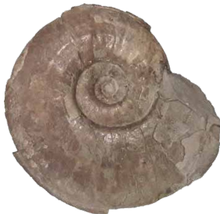
5. Ammonites Gallery: Creatures of the Past

Fossils are animals and plants that died millions of years ago. They get buried in mud or sand and turn to stone.